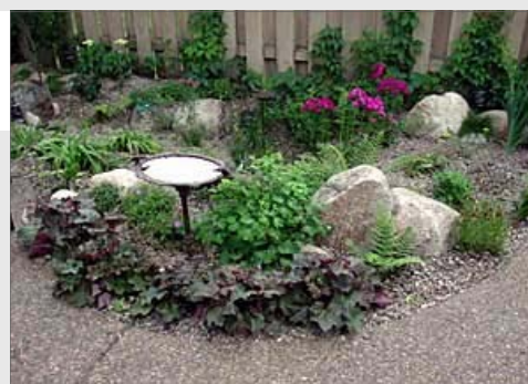
Rain garden in a small backyard that collects runoff from roof and patio.

http://www.bbg.org/gar2/topics/design/2004sp_raingardens.html .