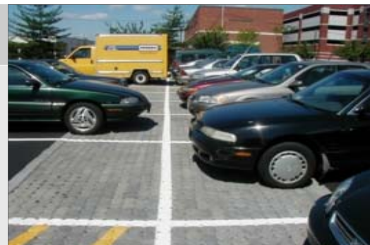
Porous pavement covers about 1/3 of each parking space in the D.C. Navy Yard parking

Retrofit a Parking Lot to increase permeability. Over sixty-five percent of impervious areas are associated with "habitat for cars". Using porous pavement in parking lots is a simple way to increase infiltration and reduce runoff. When the US Navy Yard in Washington, D.C. needed to repave its parking lot, they used porous pavers. They also added bioretention cells to the landscaped areas and disconnected downspouts. The re-design did not alter the amount of parking spots, but reduced peak runoff and pollution, thus protecting and helping to restore the Anacostia and Potomac Rivers and the Chesapeake Bay.