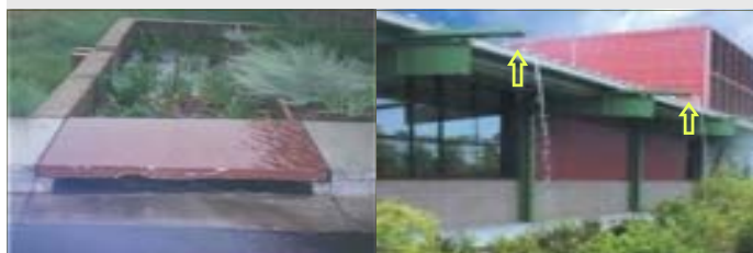
Stormdrain leading to bioretention cell