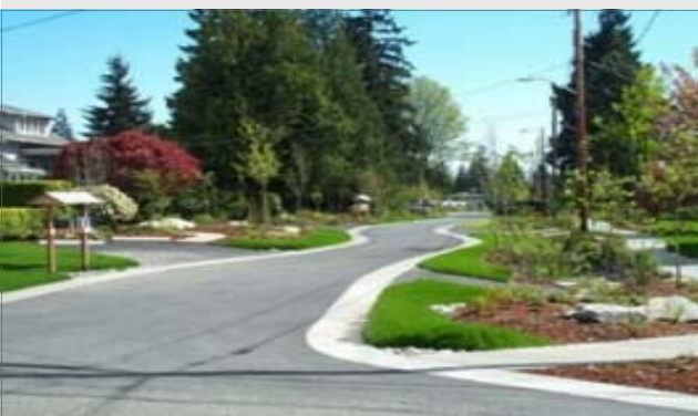
LID street design: vegetated swales, no curbs, and narrower streets promote infiltration of stormwater.

Alter street design to increase infiltration. In a landmark project in Seattle, the Street Edge Alternative or SEA project involved building vegetated swales, bioretention cells, and narrower streets without curbs to promote an effective drainage and filtration system. The system reduced peak runoff for the 2 year flood event by 98%, and is capable of conveying the 25 year flood event. The local watershed provides spawning habitat for endangered salmon. The project was so successful that similar ones are being planned throughout the city.