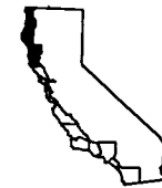
North Coast Area Location Map