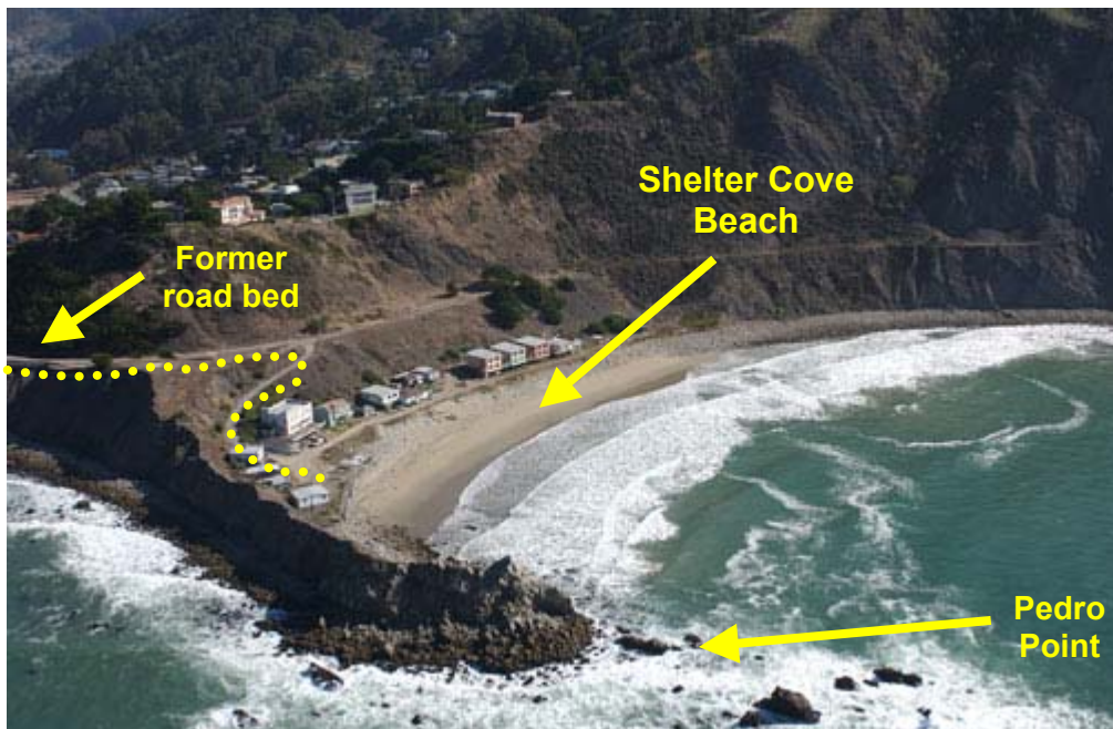
Figure 3. San Pedro Road out to Shelter Cove, Pacifica.