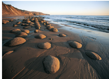
A smooth, round rock