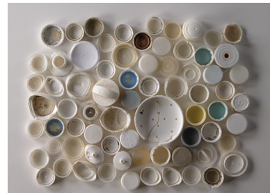
A bottle cap (pick this one up and drop it in a trash can!)

What did you think about that bottlecap? Did you see more trash on your beach? Help out by doing a beach cleanup after your treasure hunt. Use a beach bucket or a bag and carefully collect trash and carry it to a trash can. Use caution with sharp objects (Ask an adult for help!)