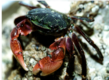
A crustacean (such as a crab, lobster, or barnacle).