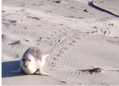
Footprints from another animal