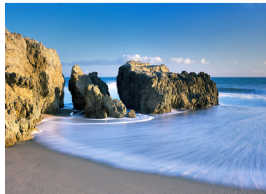
A jagged, rough rock