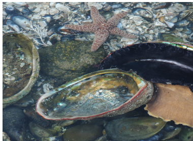
A shell of 2 or more colors