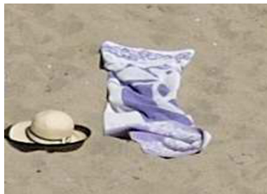
A beach towel