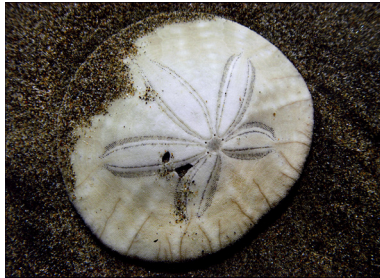
A white shell