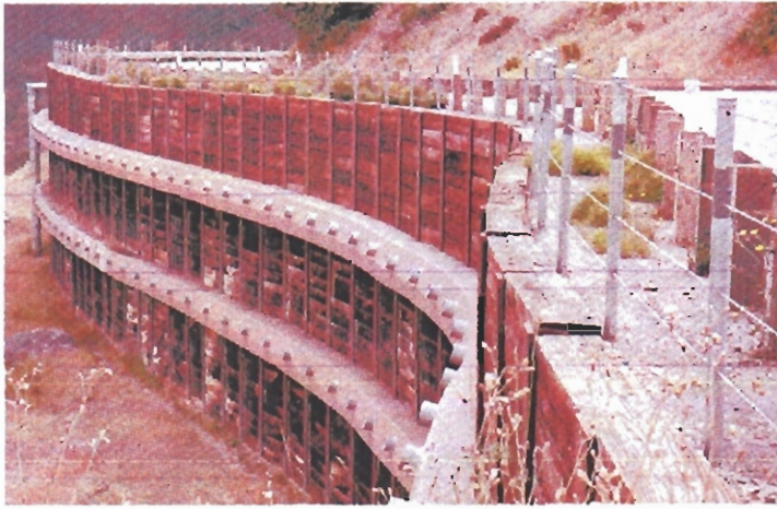
Retaining Wall with Cable Railing and Wood Lagging

Over time, as the natural wood materials become faded and weathered, the exterior color of the walls become even less visible, incorporating the natural elements of the landscape as they age.